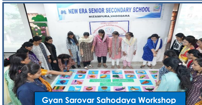
Gyan Sarovar Sahodaya Workshop