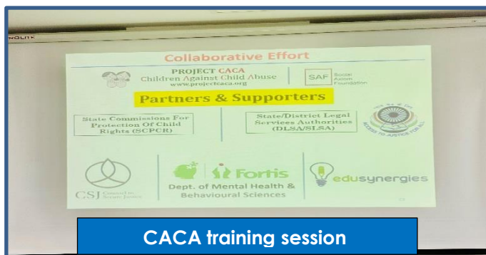
CACA training session