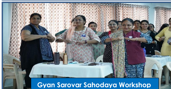
Gyan Sarovar Sahodaya Workshop