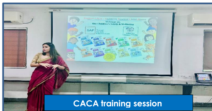
CACA training session